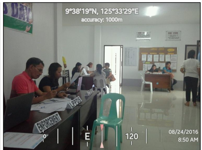
Actual People's Day Set Plan (from Registration, TWG, Section Chiefs, Technical Chief and the CENRO)